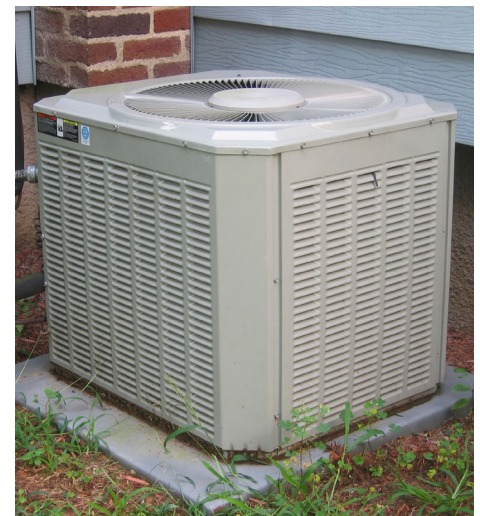
Application Shown: Residential heat pump

Its small size, a variety of mounting options and outstanding thermal response make the 3NT an excellent choice as a temperature control for dehumidifiers, freezers, heat pumps, ice makers, refrigerators, or nearly any place where a fixed temperature control device is required.